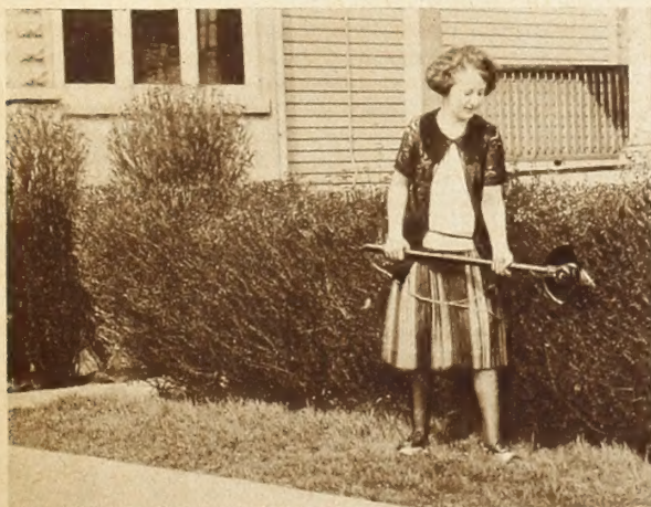
THE SPEED ELECTRIC HEDGE CLIPPER

Some owners have declared that since receiving and using the Speed Electric Hedge Clipper, their hedges do not grow fast enough, as they now rather like the little job of trimming them. Price, $35.00.